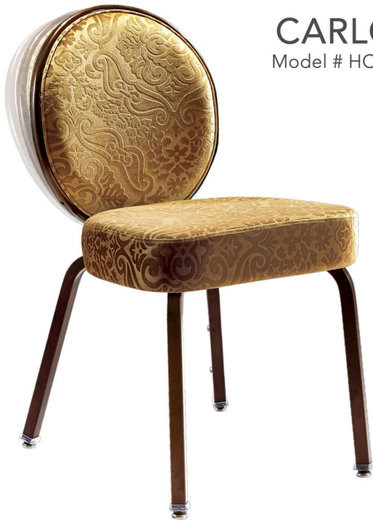
CARLO Model # HC-06